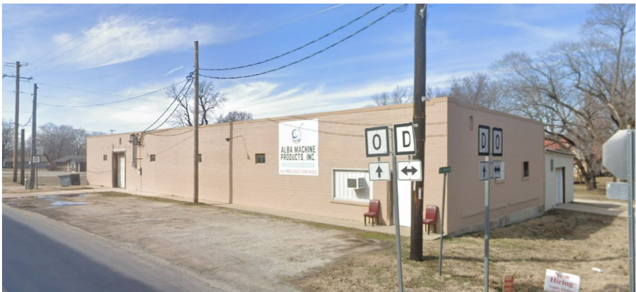
Figure 5. Alpha/Delta Corner