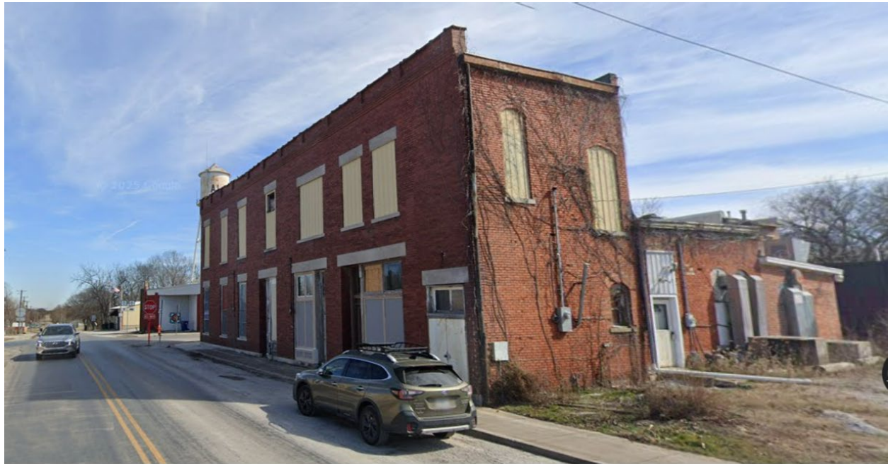
Figure 7. Alpha 1 Exposure