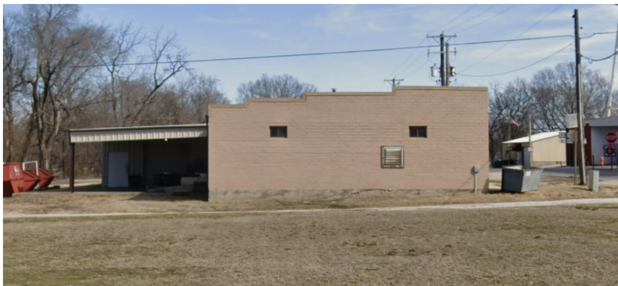
Figure 3. Side Bravo

Note: Adapted from Google. (2025a). [Street view 102 W High Street, Alba, MO]. Image capture: March 2025. ©2026 Google. https://bit.ly/4mxWZG8 .