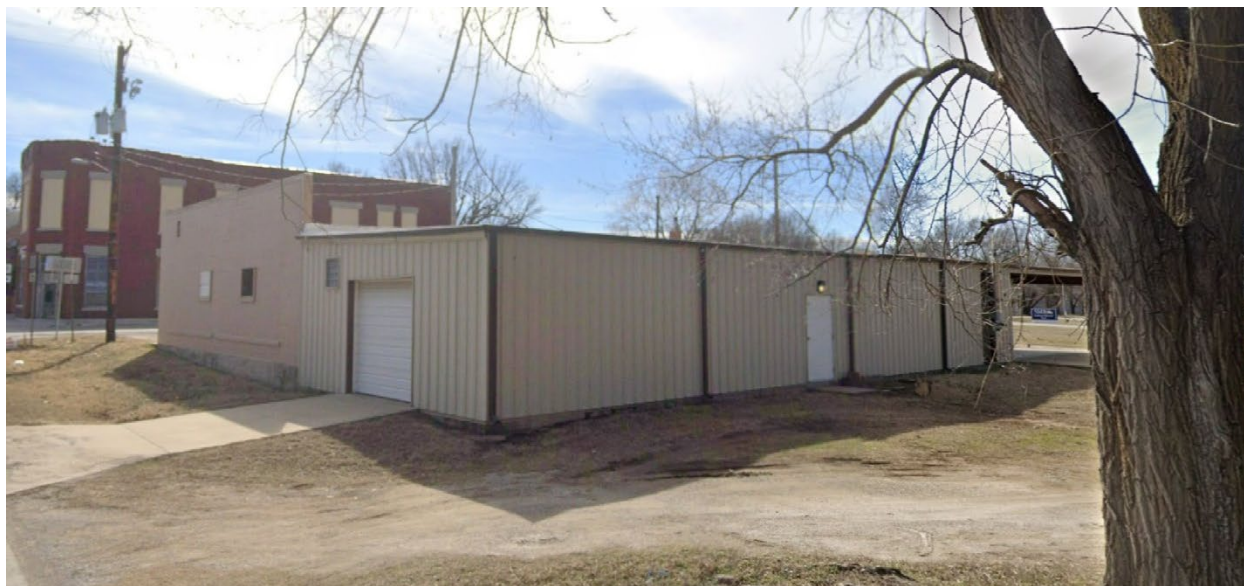
Figure 6. Charlie/Delta Corner