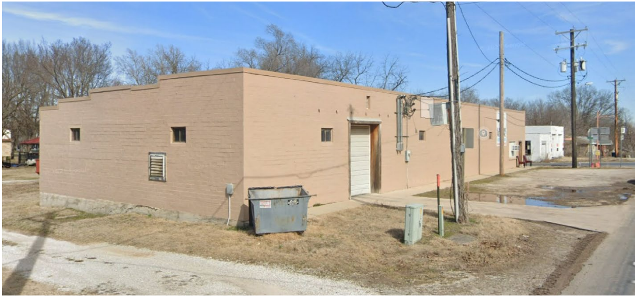
Figure 4. Alpha/Bravo Corner

Note: Adapted from Google. (2025b). [Street view 102 W High Street, Alba, MO]. Image capture March 2025. ©2026 Google. https://bit.ly/41Cl9pe .