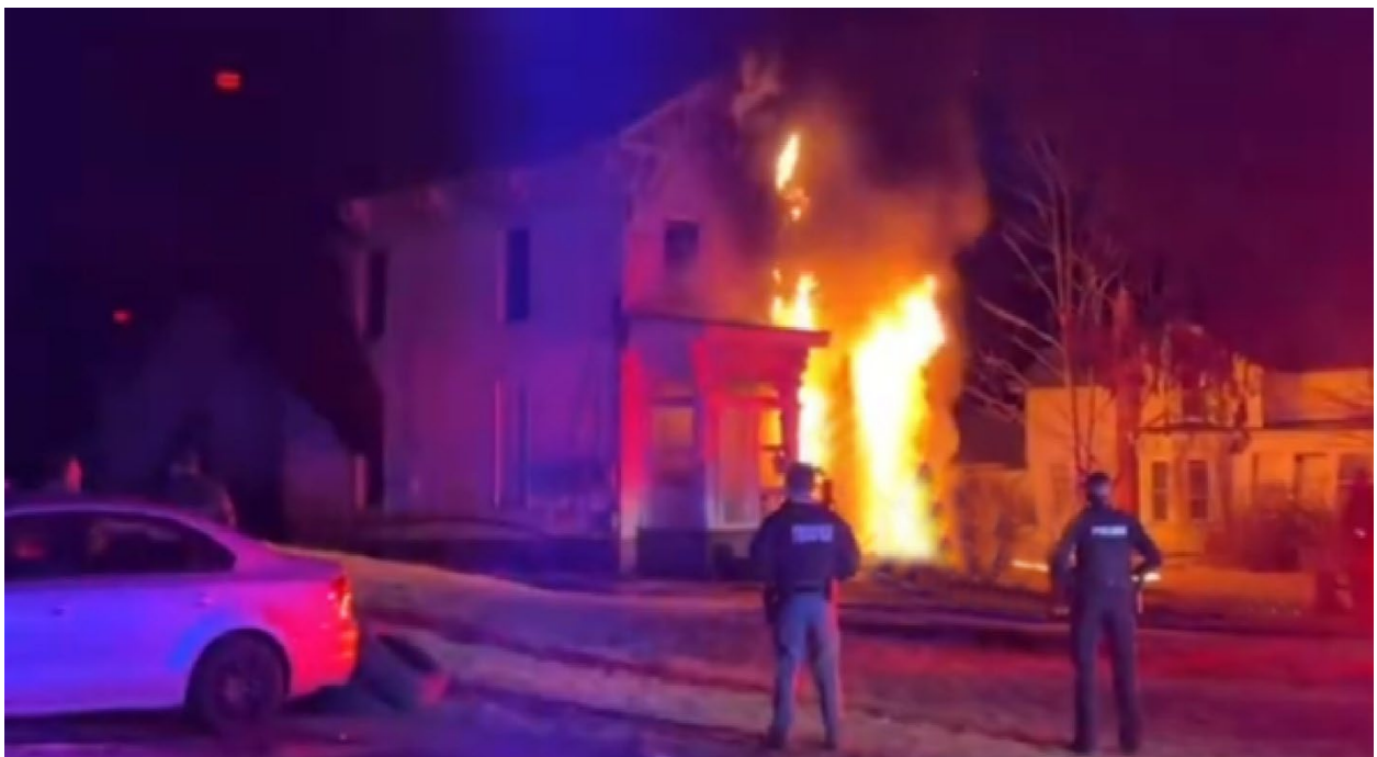
Figure 7. Conditions on Arrival-Alpha/Bravo Corner

Note: Adapted from Tri-County Fire Videos. (2025). Hudson Falls Fire, working structure fire, 1-30-2025. https://bit.ly/4gm0FWK .