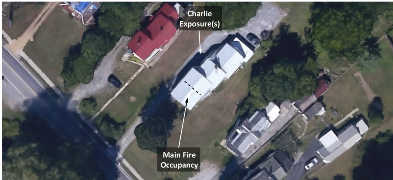
Figure 2. Aerial View