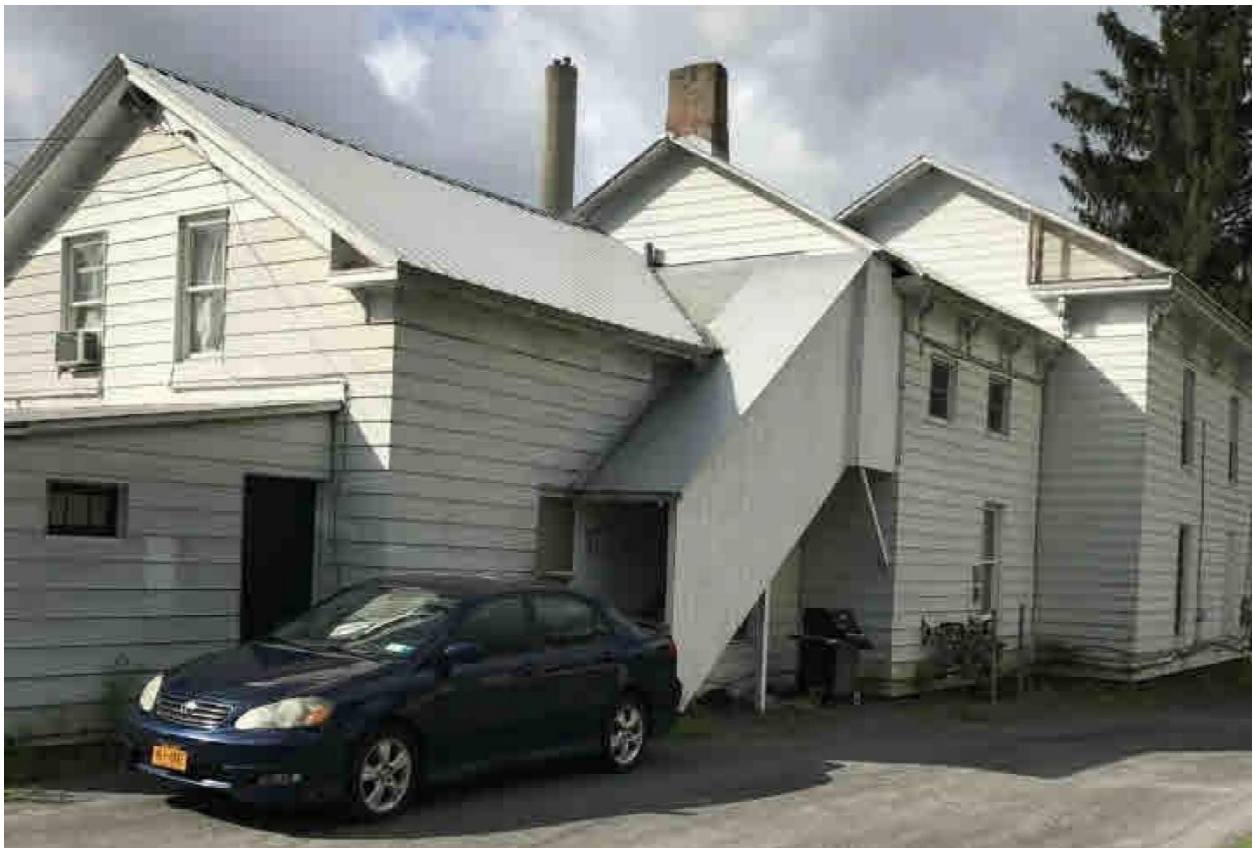
Figure 5. Bravo/Charlie Corner

Note: Adapted from Redfin. (2017). 78 River St, Hudson Falls, NY 12839. https://bit.ly/3EkKiwo .