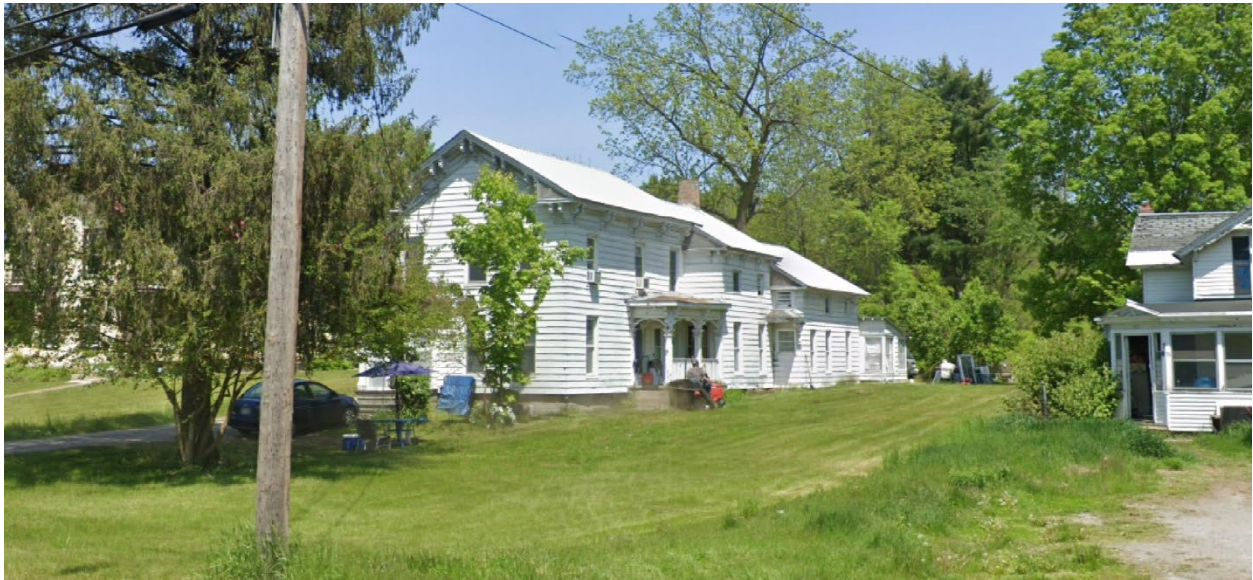
Figure 4. Alpha/Delta Corner

Note: Adapted from Google. (2024b). [Street view 78 River Street, Hudson Falls, NY]. https://bit.ly/4hGB0ct .