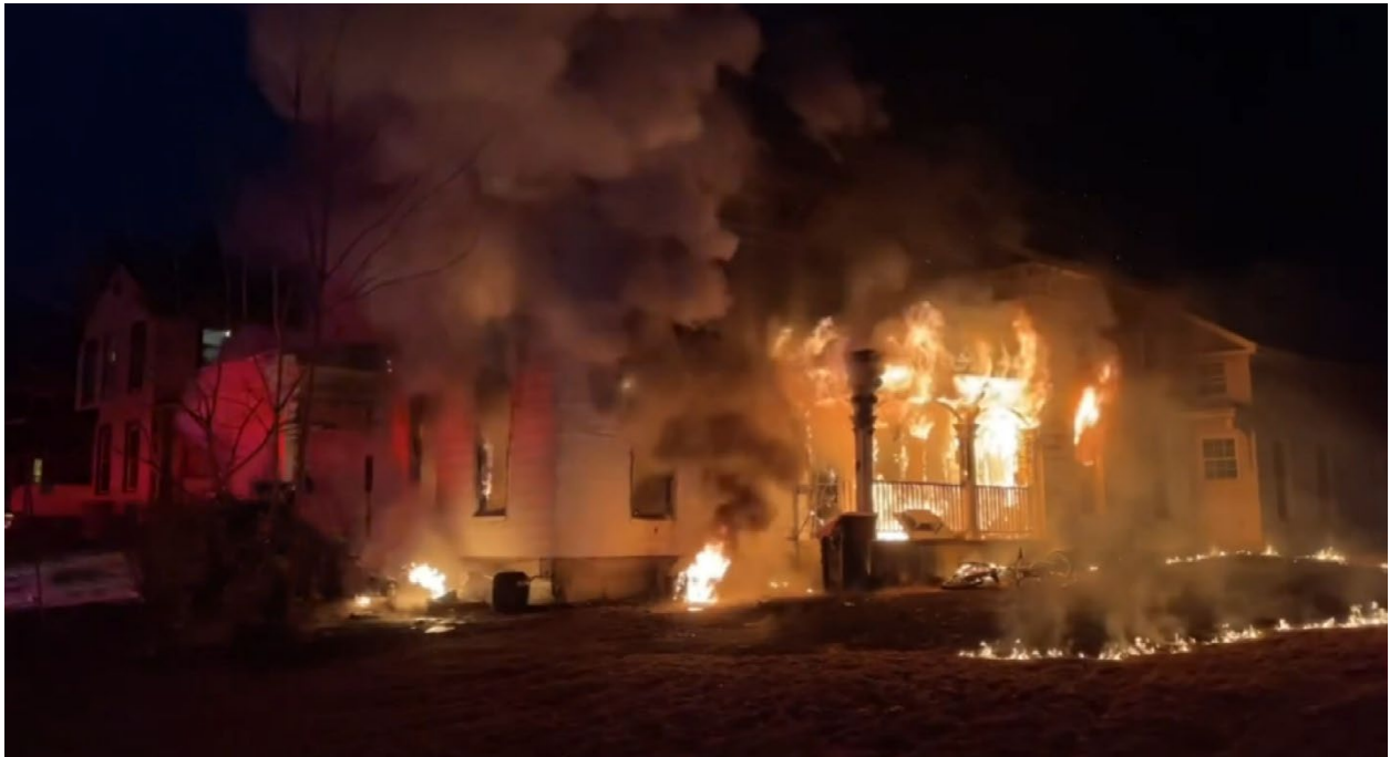
Figure 6. Conditions on Arrival-Alpha/Delta Corner

Note: Adapted from Tri-County Fire Videos. (2025). Hudson Falls Fire, working structure fire, 1-30-2025. https://bit.ly/4gm0FWK .