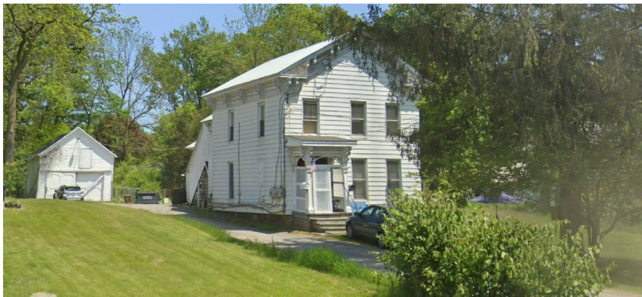
Figure 3. Alpha/Bravo Corner