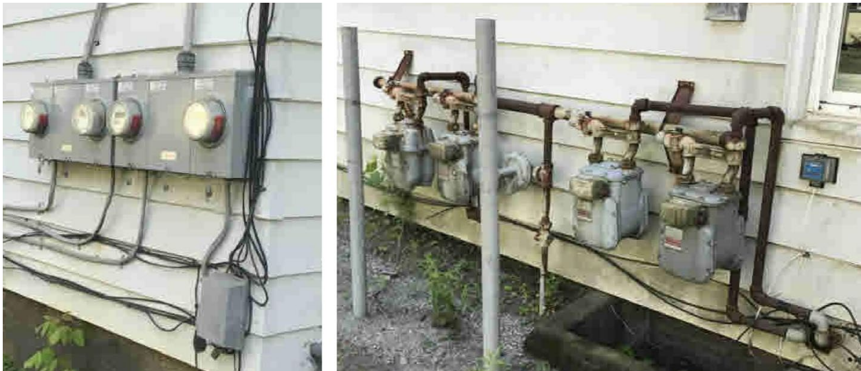
Figure 8. 78 River Street Electric and Gas Utilities

Note: Adapted from Redfin. (2017). 78 River St, Hudson Falls, NY 12839. https://bit.ly/3EkKiwo .