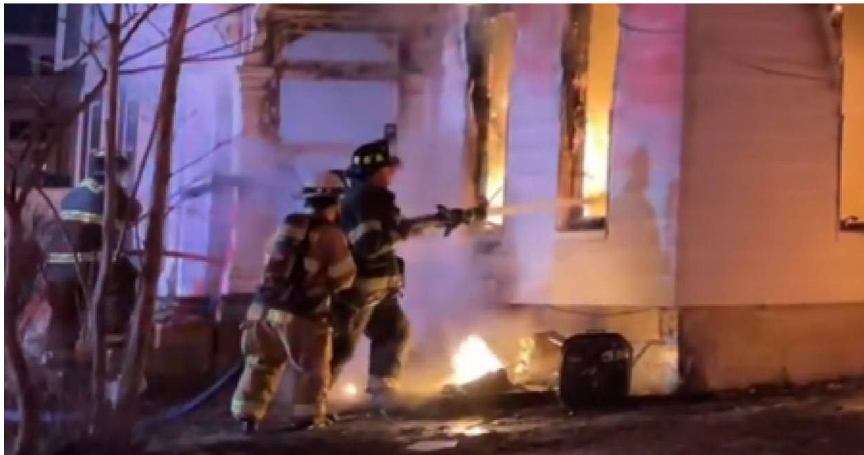
Figure 9. Exterior Water Application from Side Alpha

Note: Adapted from Tri-County Fire Videos. (2025). Hudson Falls Fire, working structure fire, 1-30-2025 . https://bit.ly/4gm0FWK .